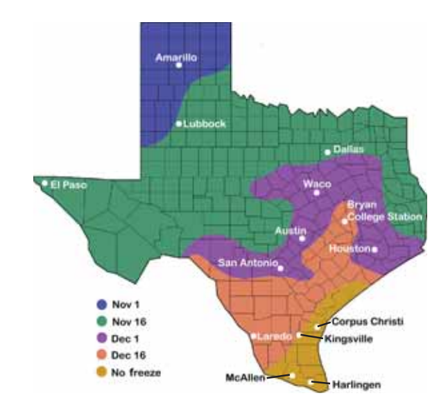
Figure 2. Average dates for the first fall frost.