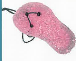
Sunscreen & Floral