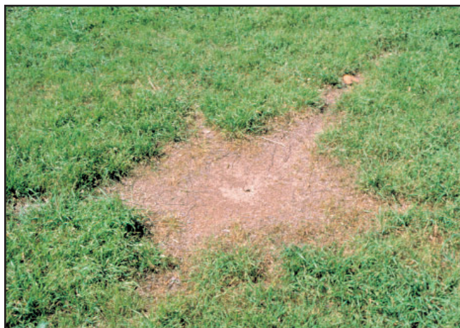
Nest of red harvester ants

Although any insecticide registered to control "ants" can be used to control harvester ants, few are registered specifically to control these species (Table 1). Harvester ants can be quickly eliminated using Amdro® Pro Fire Ant Bait (0.73 percent hydramethylnon) or similar products. Individual