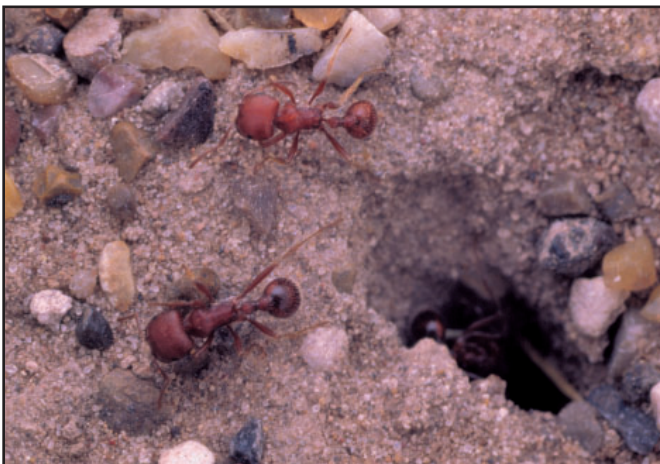
Red harvester ants

Worker ants are \frac{1}{4} to \frac{1}{2} inch long and red to dark brown. They have squarish heads and no spines on the body. There are 22 species of harvester ants in the United States, 10 of which are found in Texas. Seven of these species are found only in far west Texas.