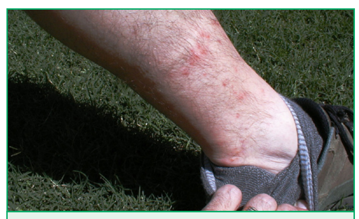
Chigger bites are most common on the lower parts of the body in areas of tight-fitting clothing, such as under socks.

Contrary to common belief, chiggers do not burrow into a host's skin or suck blood. They pierce the skin with their sharp mouthparts and inject a digestive enzyme, disintegrating skin cells for food. Itching usually begins within 3 to 6 hours after an initial bite, followed by development of reddish areas and sometimes clear pustules or bumps. As the skin becomes red and swollen, it may completely envelop the feeding